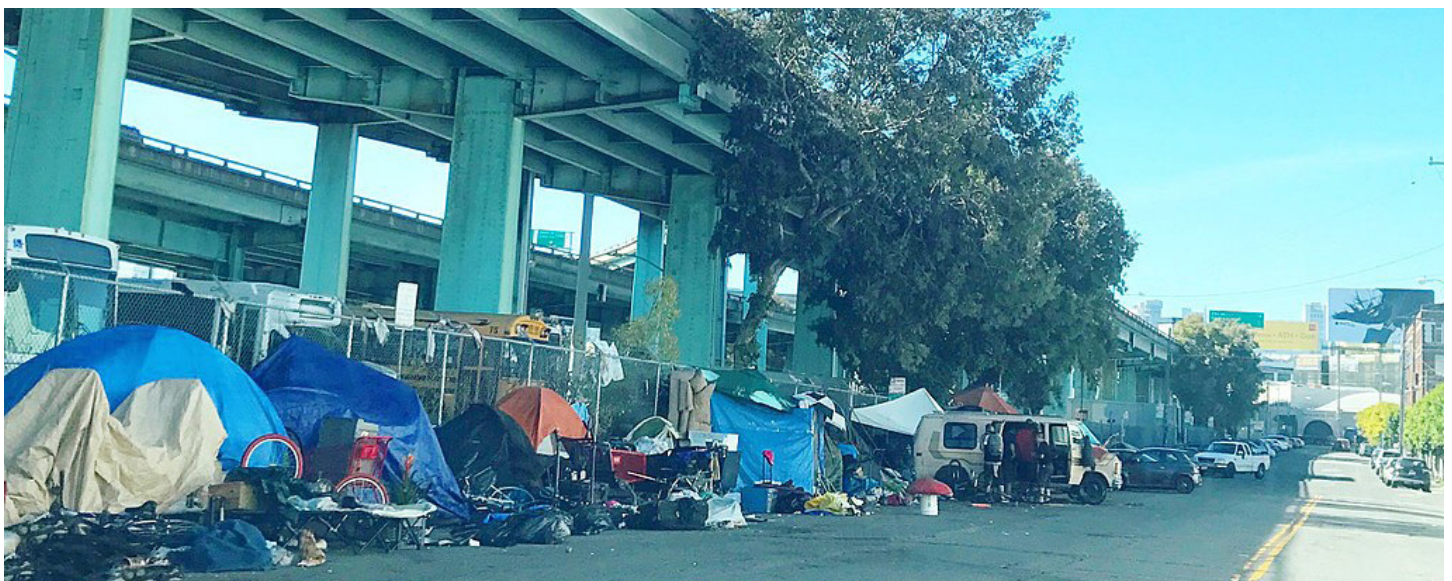
Homeless tents in San Francisco

Finally, recognizing the difficulties in counting homeless youth, San Francisco also conducts a survey specifically for homeless youth to profile their experiences.