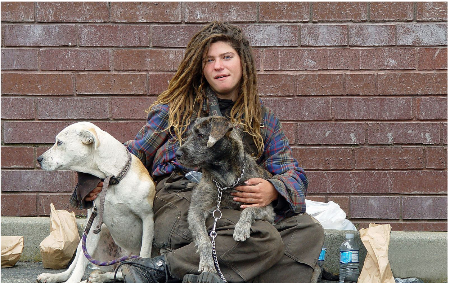
Image from https://www.flickr.com/photos/livenature/ , CC BY-SA 2 | Wikimedia Commons

Riverside County's unsheltered point-in-time count has four components: a street count, a service-based count, a follow-up count and survey, and a youth count. In 2019, the street count was conducted from 5:30am to 9:30am in one day. The service-based count, held at food-banks and agencies that commonly provide services for unsheltered individuals, spanned three days, from 8:00am to 1:00 pm. Likewise, the youth count spanned three days and was held from 2:00pm to 8:00pm. The follow-up count and survey were conducted in the seven days following the initial street count to count unsheltered individuals living in unincorporated