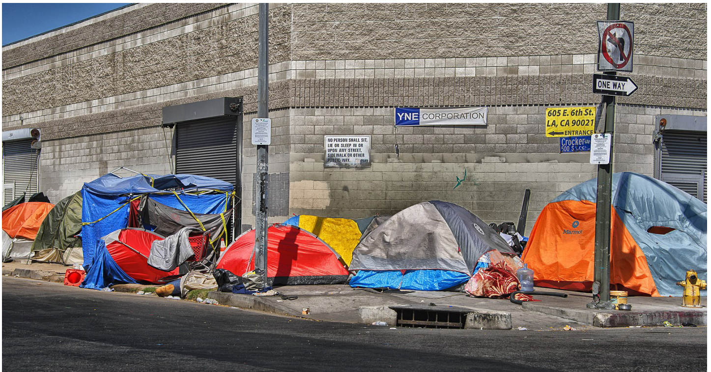
Tenting on skidrow.

LAHSA's second point-in-time count is a demographic survey, a joint effort with the University of Southern California. The methodology to divide geolocations and project populations in the county was based on statistical inference drawn from 2017 data. The purpose of LAHSA's demographic survey is to collect data on the sample of homeless adults in LA County that would otherwise not be found in the traditional visual count and to determine the multiplier for the number of homeless residents living in cars, makeshift shelters,